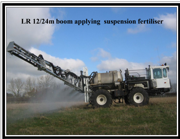
LR 12/24m boom applying suspension fertiliser