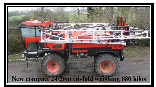
New compact 24/36m tri-fold weighing 680 kilos

Simple upgrading to a high specification boom can be carried out, or a complete re-build if required. We will be able to assist with expert advice, particularly if you are considering a larger boom width, eg. checking pump capacity, hydraulic services, nozzles, and offering advice on electronic control systems.